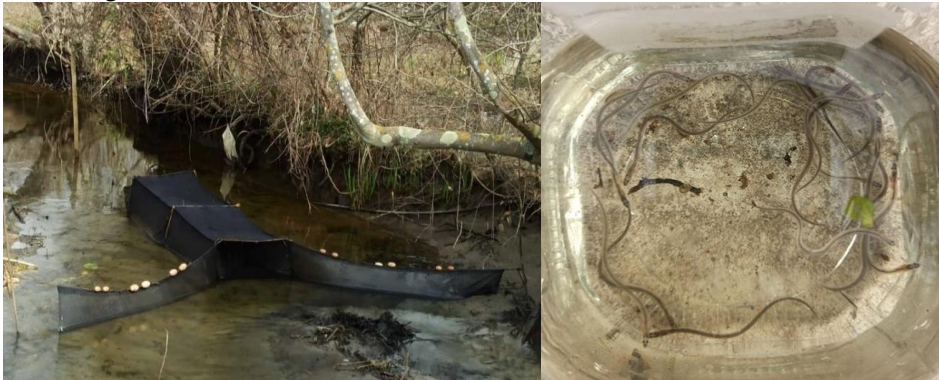
Figure 2a (left). Fyke net at the sampling locations; Figure 2b (right). Glass eels from River Bojana (Montenegro). After measuring the glass eels were returned back to the water

The captured glass eel individuals were measured to the nearest 1 mm (total length, TL) and weighed to the nearest 0.1 g (weight, W), and then returned back to the water (Figure 2b). Stadium of pigmentation was determined according to Elie et al. , 1982. Data of the Fulton's condition factor (CF) of the analyzed specimens was calculated from the W (g) and TL (cm) using the formula according to Fulton (1904).